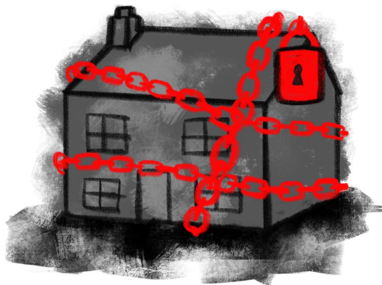
Figure 5: Housing problems for people on UC included arrears and threats of eviction, especially during the transition onto the benefit

To a large extent, participants’ housing problems were also debt problems. The five-week wait for a first payment, payment of the housing costs element of UC to the recipient when he or she was expecting it to go to the landlord, and the delayed commencement of supplementary payments (see below) could result in substantial rent arrears. Participants sometimes faced ongoing shortfalls, where their rent was higher than the Local Housing Allowance (LHA; something that affects people on Housing Benefit as well as UC recipients). Participants also spoke of financial pressures around housing linked to the payment of their rates – equivalent to Council Tax in Great Britain – or a landlord’s service charge, which UC does not cover. Where these financial pressures led to arrears, participants sometimes received repeated letters warning of eviction proceedings, although in practice many landlords – particularly social landlords – proved more understanding when spoken to in person. Even when arrears did not themselves bring an