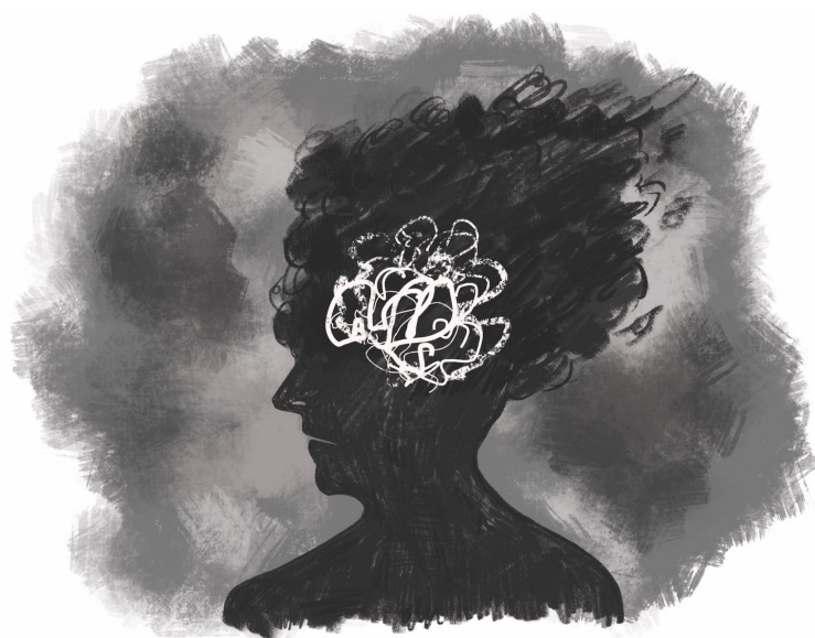
Figure 7: The experience of claiming UC was often found to worsen existing mental health conditions and create new ones