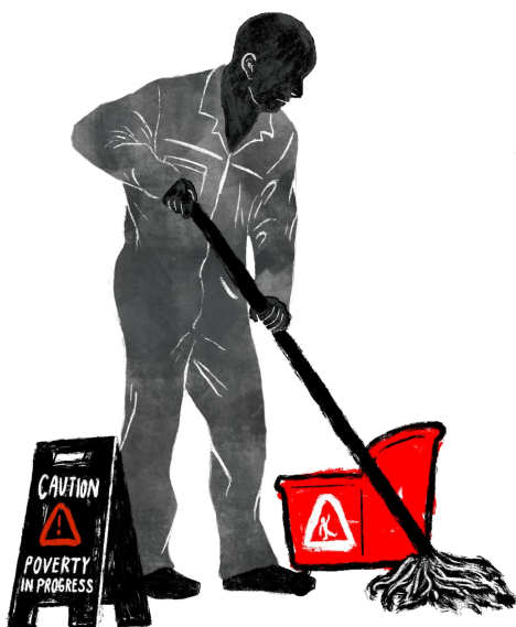
Figure 6: UC is for people in paid employment, as well as those currently out of work