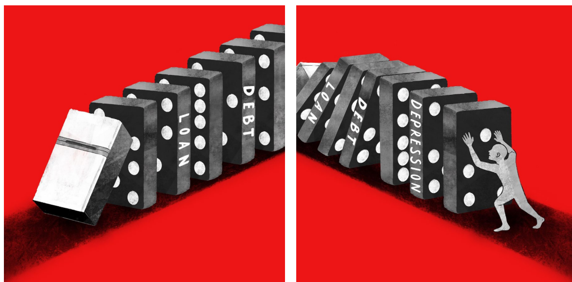
Figure 4: Participants described claiming UC as triggering a series of negative domino effects, starting from the debt that was caused by the (at least) five-week wait for a first payment

One consequence of having to take on debt in the form of the advance payment just to meet normal, everyday needs was that it could be hard to access additional support when unforeseen expenses arose.