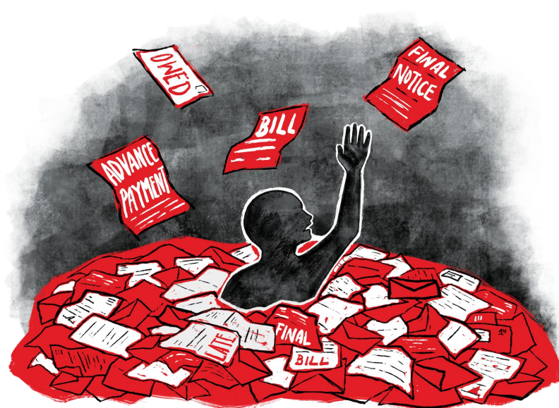
Figure 1: Debt was a constant feature for many participants