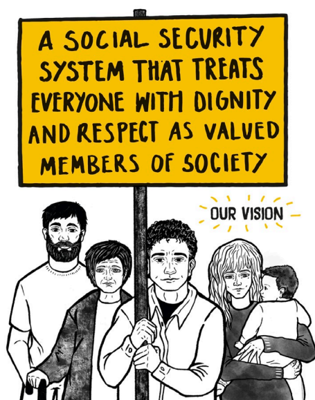
Figure 8: Participants in the study came up with an overarching vision for the future of social security

Due to the parity convention, the policy direction set by the UK Government has always been the starting point for social security in Northern Ireland (see Chapter 2). There has never been a serious political debate about the principles or philosophy that ought to underpin a Northern Ireland-specific system (Simpson, 2017b). While Unionist politicians have sometimes argued that all UK citizens should enjoy the same set of social rights as a matter of principle, the perceived lack of affordability to Northern Ireland of either more generous benefits or the administration of a radically different system have become increasingly key arguments in favour of a shared approach. Even as elected representatives have become more willing to question the merits of strict adherence to parity, the focus has been on softening some of the harder edges of approaches in Great Britain, rather than considering what foundational principles would work for Northern Ireland (Simpson, 2017a).