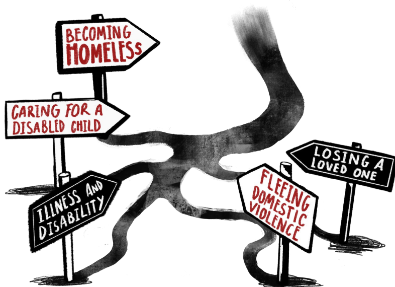
Figure 3: Participants described their journeys on UC, and worked together with an illustrator to develop a leaflet outlining their experiences and recommendations for change

While each experience of UC is unique, some key milestones were widely shared. Together, the participants and researchers identified the following key stages and features of the UC journey: