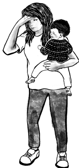
Figure 2: The project was a partnership with recipients of UC